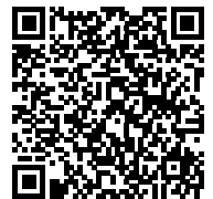
Visit our product page